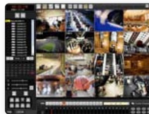
CMS Live View