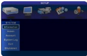
DVR GUI Screen